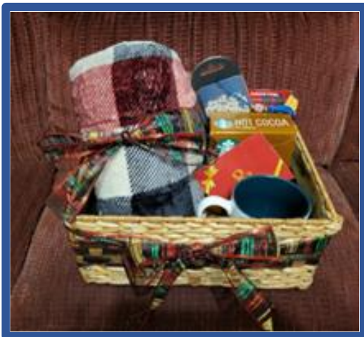
Cozy Up with a Good Book basket

Our meeting will begin at 10:20. Bidding on the basket is open from 10:00 a.m. to 12:00 p.m. Donations will be accepted if you choose to support the Scholarship fund in that way.